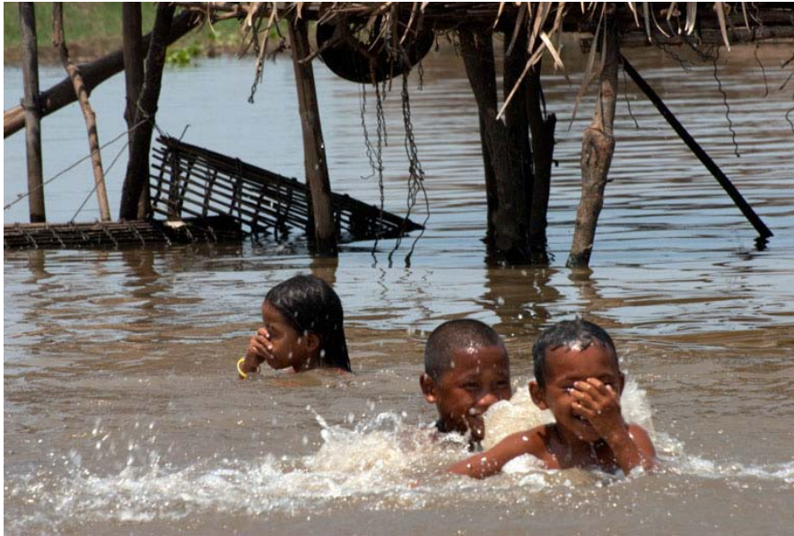
Children playing in the Tonle Sap Lake in Cambodia underneath and around their floating homes.

This lake is everything to them as well as their playground.